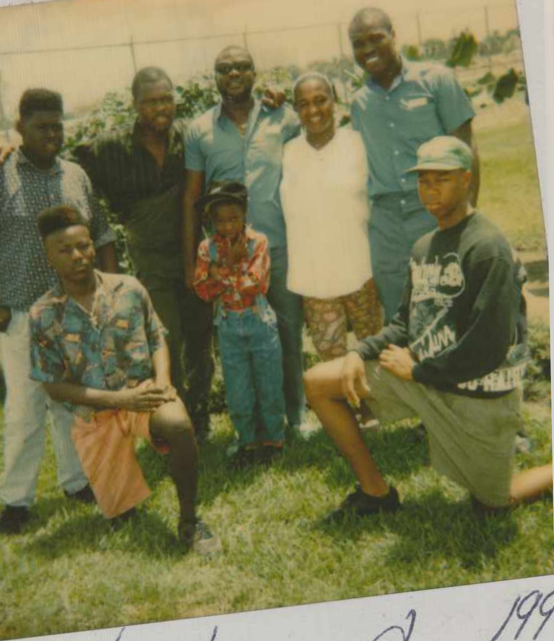
1994 THE JAMES GANG 4 C.I